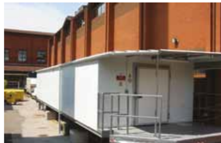
Direct loading - Easy access