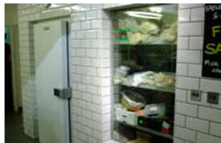
Tailor made solutions