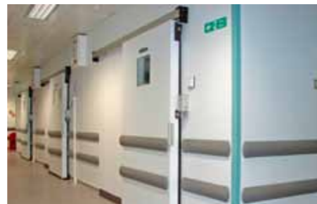
Single rooms or flush fitting suites